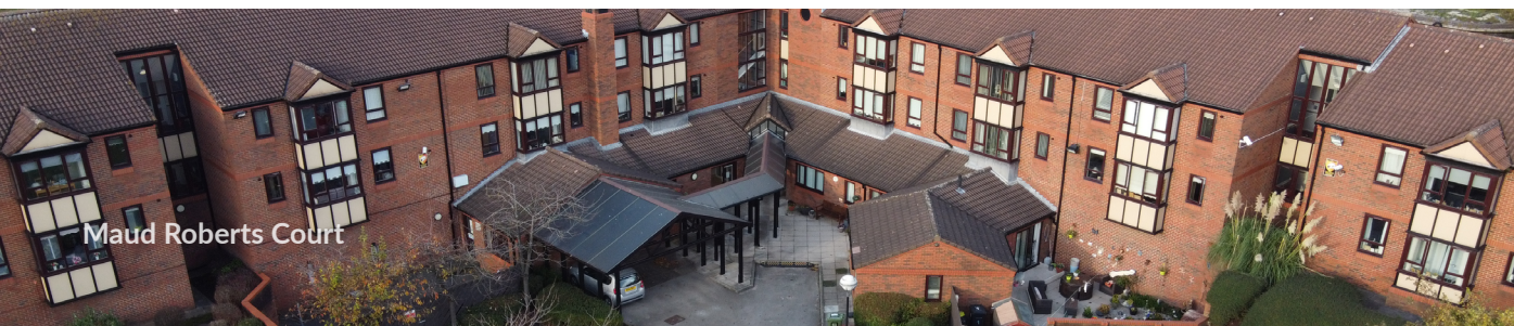
Maud Roberts Court

Find out more information on how you can join the Prima Customer Board here .